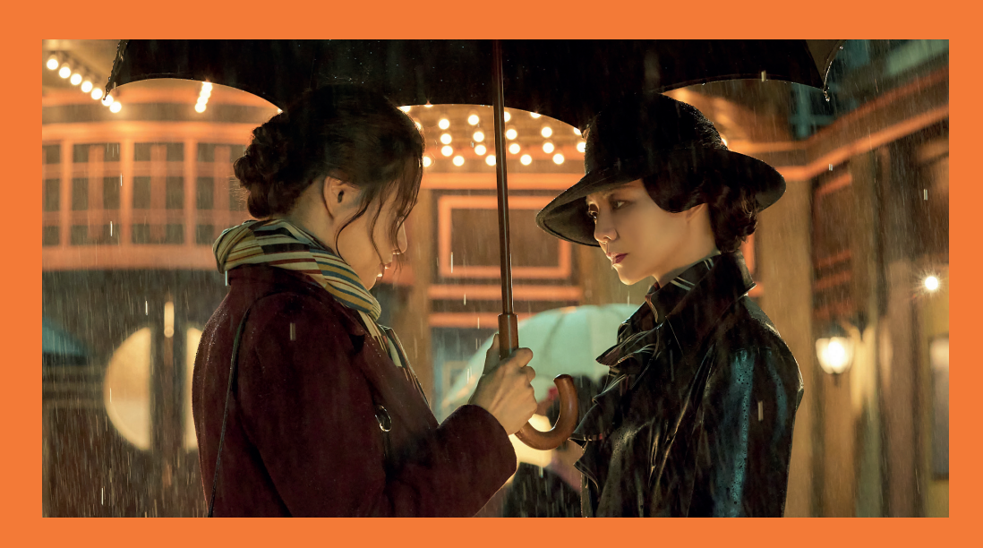
Awards Fantasia Film Festival 2023 Nominee Cheval Noir Best Film

29 October 2023, Sunday, 4pm, GV Suntec City 5 November 2023, Sunday, 7pm, GV Suntec City